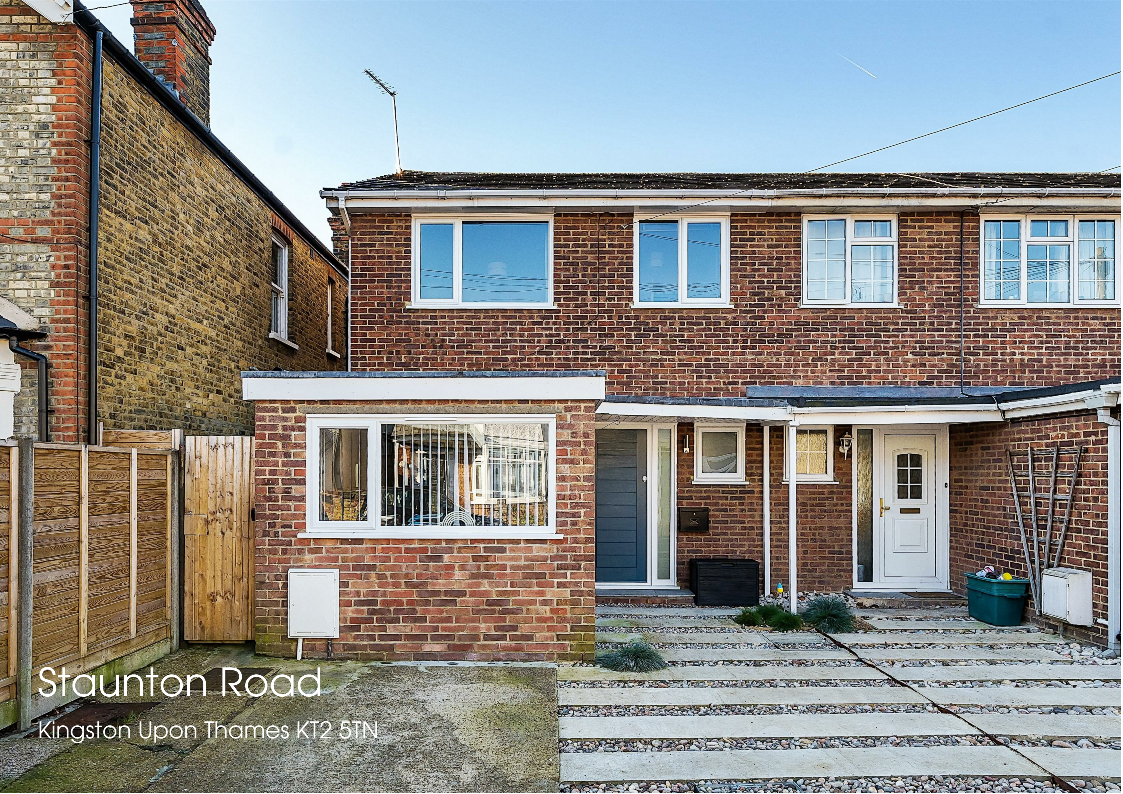
Staunton Road Kingston Upon Thames KT2 5TN